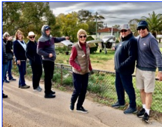
Who has a plane in their front yard?!!