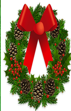
CHRISTMAS IN JULY IN QUAIRADING