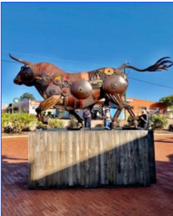
Very impressive bull statue