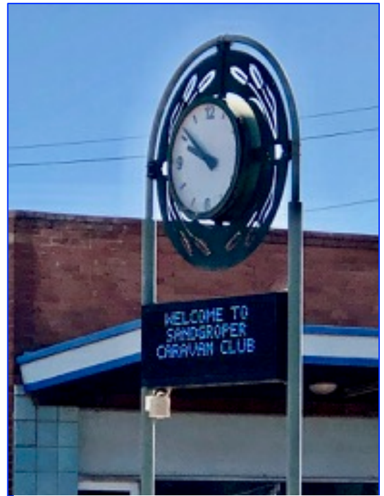
Welcome sign in friendly Quairading

Friday morning we set off on the 'Toro Tour', which was a lot of bull! We had a caffeine fix at the coffee van while we admired the spectacular bull statue, which takes pride of place outside the Shire Hall. It was terrific to see the Sandgropers 'Welcome' sign up in lights in the main street, which really did make us feel welcome. The locals were very friendly and went out of their way to make sure we had everything we needed and advised us on shop opening hours etc. We really appreciated it.