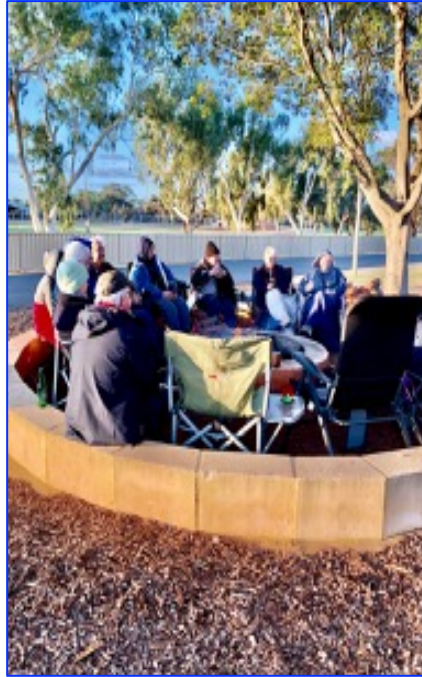
The ever-popular fire pit was the place to be all weekend.