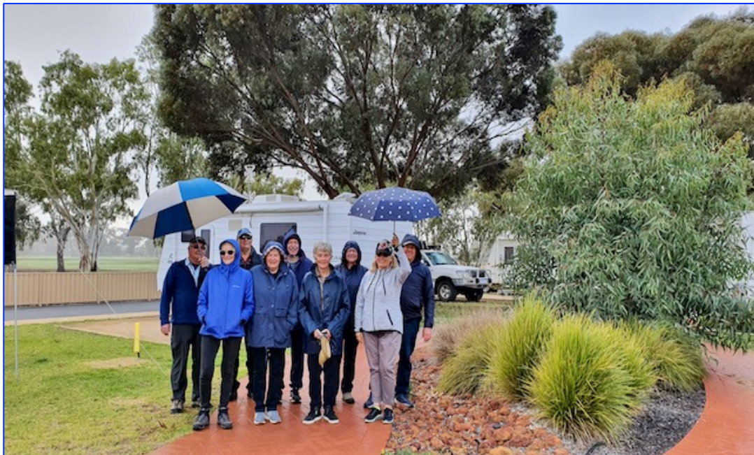
Intrepid Sandgropers, dressed in blue, setting off on their Sunday morning walk.